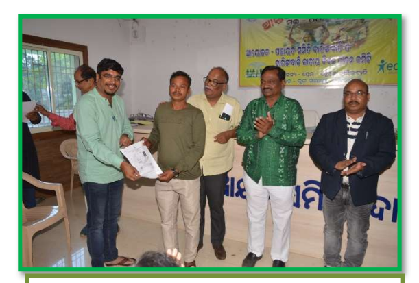
Distribution of Labour card to the beneficiary