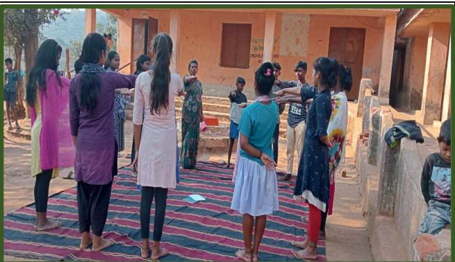
Adolescents taking oath not get marry at an early age