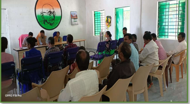
Women farmer's training at Karadapankal village of Birikote GP