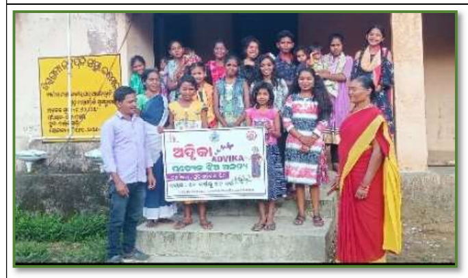
Adolescents attending Adwika program