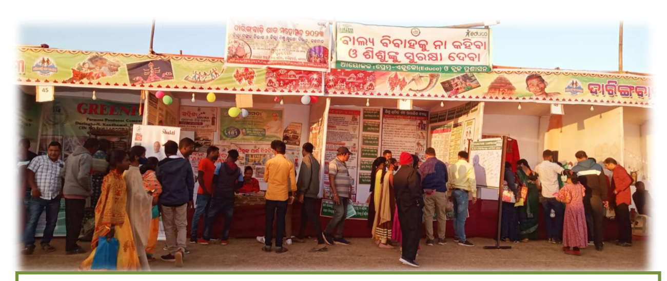
PREM's stall on Say no to child marriage during the Winter festival at Daringbadi

The Block administration, Daringbadi with the support of the District administration Kandhamal, other line departments of the block and NGOs/CBOs of block organised a Winter Festival (Sheeta