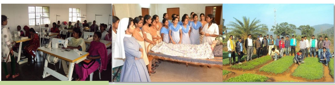
Electronic Sewing Machine training to Tribal Adolescents

training at Chandragiri by the experienced resource persons. These trainees learned improved agriculture practice which they demonstrated at their native place and attracted the attention of their fellow farmers. Vocational trainings are being offered to adolescent girls through AshaJyoti program of project PREMA. Coaching facilities are being offered for school drop-out girls to appear secondary school examination and employment opportunities are also created for these girls such as, Industrial Sewing Machine Operation at textile firms outside the state are being facilitated for interested girls. 19 beneficiaries have been enrolled in this program.