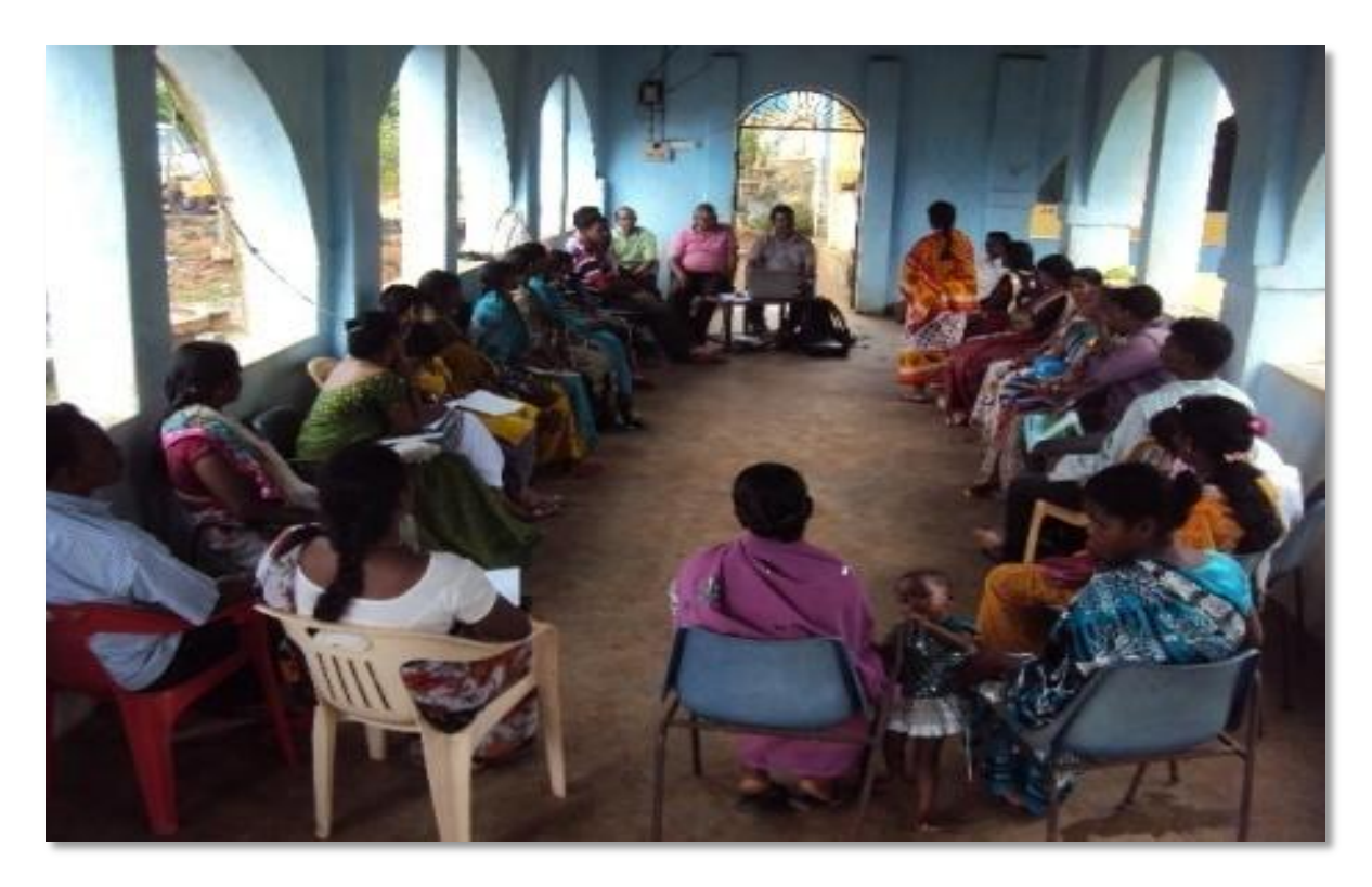
Capacity Building Programme on Financial Inclusion