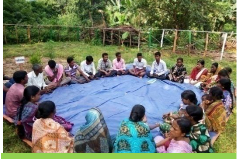
Village Level Parents Meeting to strengthen MTMLECE