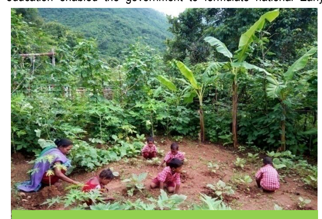
Kitchen Garden by Children at CBCD Demo Center

In the backdrop of adoption of the policy for extending the mother tongue based early child education in Government ICDS centres in tribal areas, PREM changed its work strategy and now PREM is running 32 CBCD demonstration centres equipped with all context specific MTMLECE teaching and learning materials specially focusing on the child's psychology where there is no ICDS centre and working with 48 existing government ICDS centres and followings are some of the strategies adopted presently through this program to scale-up MT ML ECE model of PREM: