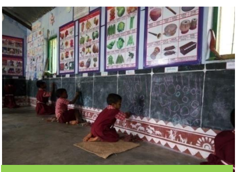
Children practicing drawings in their black board at CBCD Demo Centre