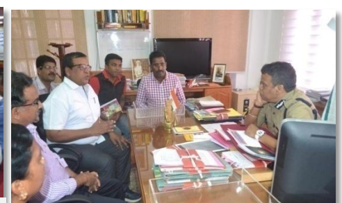
NACDIP Core Team Meeting with DGP, Kerala