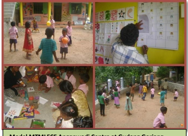
Model MTMLECE Anganwadi Centre at Gudang Gorjang

The village GUDANG GORJANG in Gumma block of Gajapati District, Odisha has been successfully following the above commandments and the village is considered as a model village. People became organized and regularly maintain cleanliness and hygiene as per village committee decisions. The people of this village became very keen for education and hence they have established a Mother Tongue Based Early Childhood Education Centre and all the context specific teaching and learning materials are provided by PREM and the teacher of this centre got training on the transaction process of MTMLECE. The model village inspires the neighbor villages to replicate this model initiative in their villages.