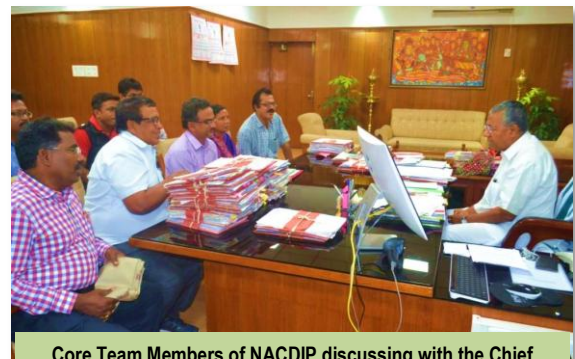
Core Team Members of NACDIP discussing with the Chief Minister, Kerala for implementation of MTMLECE in tribal areas of Kerala

2002 with support from it's network partners and the other international non-government organizations. To promote and implement mother tongue based multilingual early childhood education in tribal areas of India in true spirit as per the National ECCE Policy, the campaigns launched by NACDIP builds understanding on importance of early childhood education among the stakeholders of inter and intra states, create demand for quality implementation, upgrade Mini-ICDS centers in to Main ICDS centers in tribal areas, opening of new ICDS centres in tribal hamlets irrespective of numbers of children and population, create opportunities for the tribal women as a centre facilitator in the Anganwadi centres.