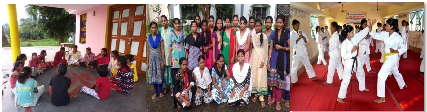
ASHG Meeting of Adolescent Girls

Sensitization to AWWs/Supervisors/CDPO: 224 Anganwadi Workers including other ICDS officials were sensitized on the project goal, objectives, activities and their roles and responsibilities. 62 ASHA Workers of Gumma block were oriented on the project objectives and activities. This program will definitely support the project objectives especially in promoting reproductive and sexual health education among the adolescent girls.