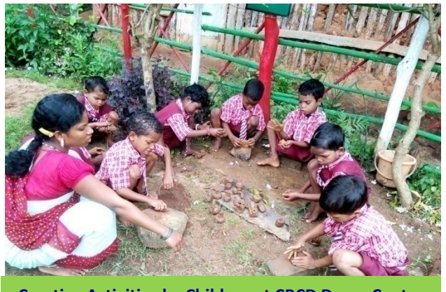
Creative Activities by Children at CBCD Demo Center

In pursuance of this successful outcome of this piloted initiative, Government has recognized the importance of the mother tongue based early childhood education and