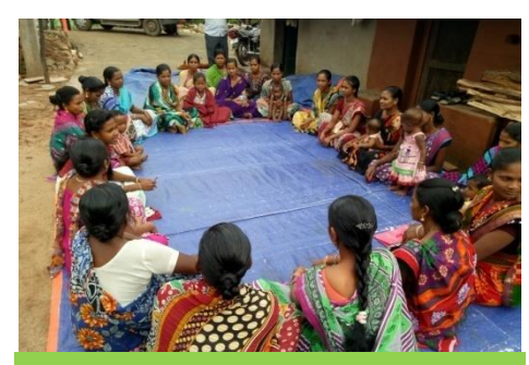
Mothers Meeting for Effective Participation in MTMLECE Transaction Process